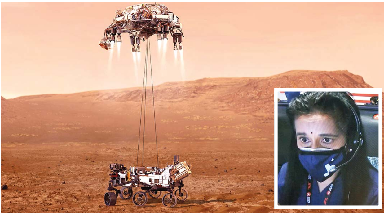
An illustration of NASA's Perseverance rover landing safely on Mars. (inset) Indian-American scientist Swati Mohan, who led the guidance, navigation, and control operations of the Mars 2020 mission

32 million worldwide, over 200 Indian-origin people occupy leadership positions in 15 countries