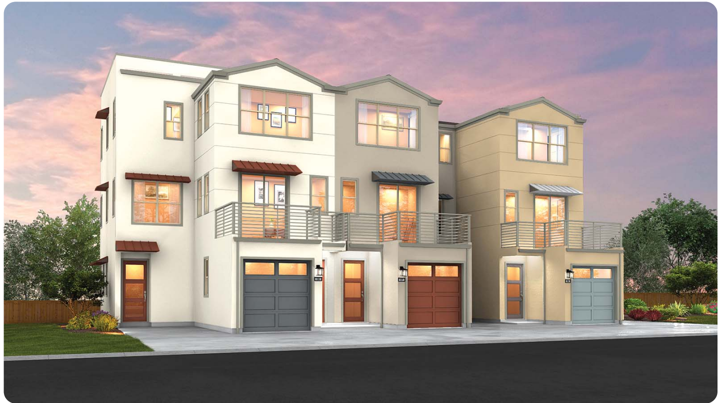
Village Station in Santa Rosa announces a new release of new homes with a real place of business on the first level

The first floor is a dedicated, professional workspace, complete with a true entrance, a large open room enhanced by a wall of windows for a retail-style design and lots of natural light, an ADA