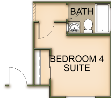
Bedroom 4 Suite (in lieu of Bedroom 4)